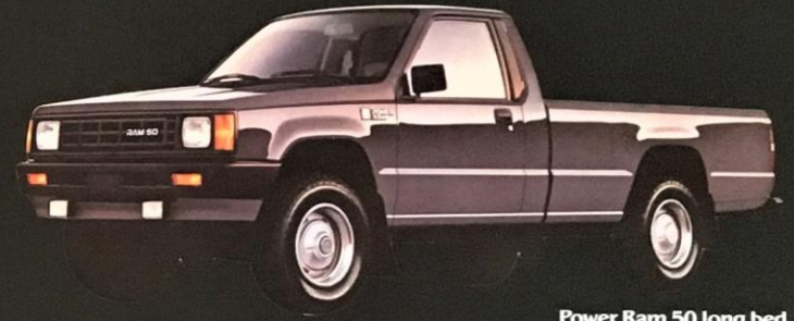
Power Ram 50 long bed

And because everyone's idea of fun differs, we offer two additional Power Ram 50 models: the Custom long bed and the Sport standard bed to suit your idea of a good time.