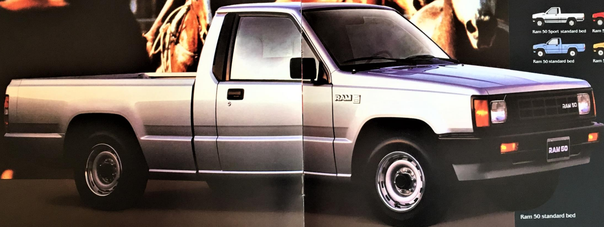
Ram 50 standard bed