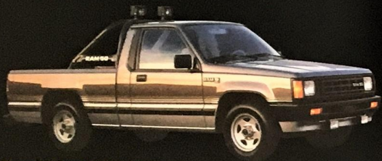
Ram 50 Sport standard bed

The Ram 50, Ram 50 Custom and Ram 50 Sport. Look as hard as you like—we're sure you'll like what you see.