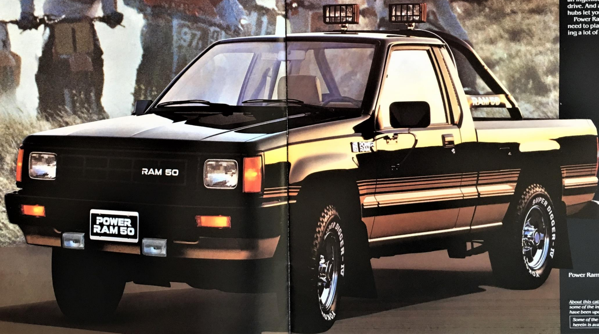
Power Ram 50 Sport standard bed

Power Ram 50 has just what you need to play in the dirt—without spending a lot of green.