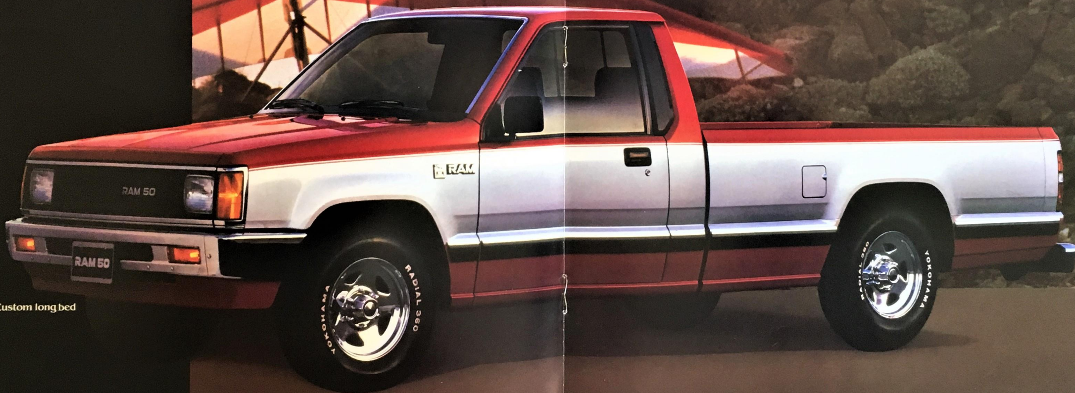
Ram 50 Custom long bed