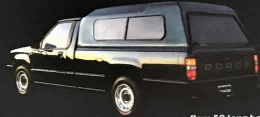
Ram 50 long bed

The Ram 50 is proof that you don't have to be big to get your payload underway.